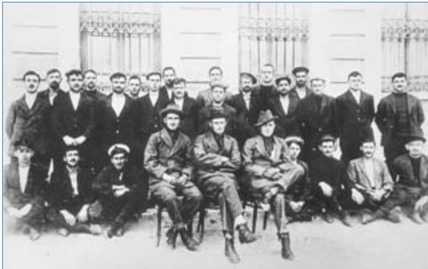
The Crew of HMA Submarine AE2

Her campaign ended five days later on 30 April 1915. The AE2 was lost, scuttled by her crew after being fatally damaged in an engagement with the Turkish torpedo-boat SULTANHISAR. Her crew of 32 was taken as prisoners of war.