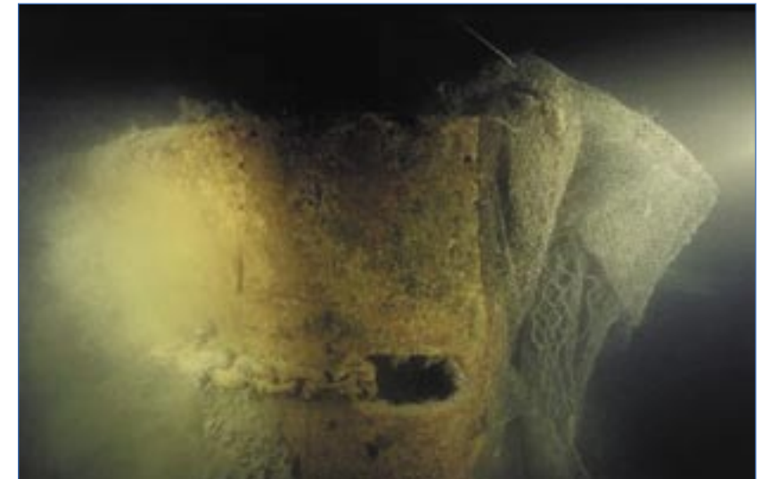
AE2's starboard bow draped in fishing nets

The SIA seeks indications of interest from potential partners to support these efforts and participate in implementing the agreed future to preserve AE2 and recognise Australia's silent heroes of Gallipoli.