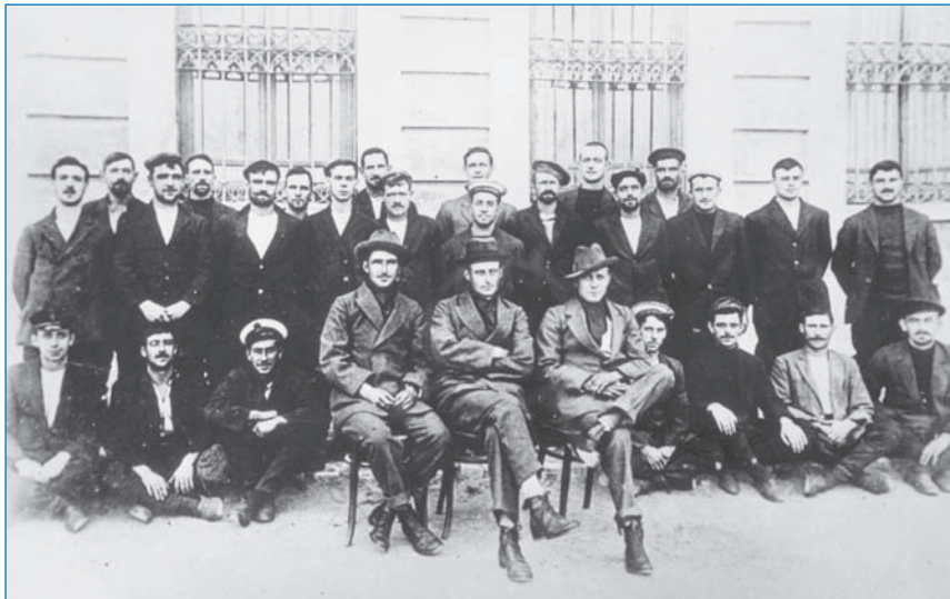
The Crew of HMA Submarine AE2 as POWs in Turkey, 1915

Her campaign ended five days later on 30 April 1915. The AE2 was lost, scuttled by her crew after being fatally damaged in an engagement with the Turkish torpedo-boat SULTANHISAR. Her crew of 32 was taken as prisoners of war.