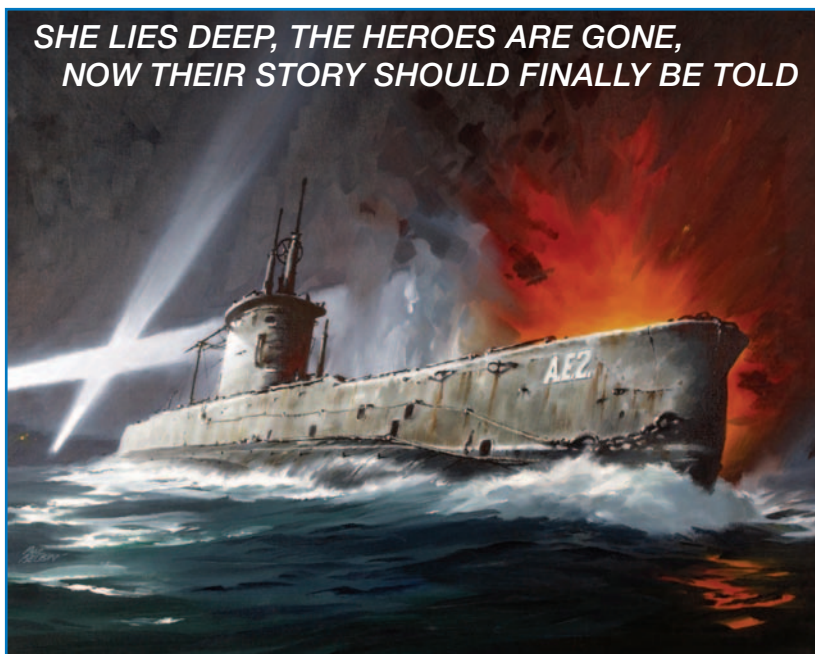
HMA Submarine AE2 'running amok in the Narrows' Painting by Phil Belbin