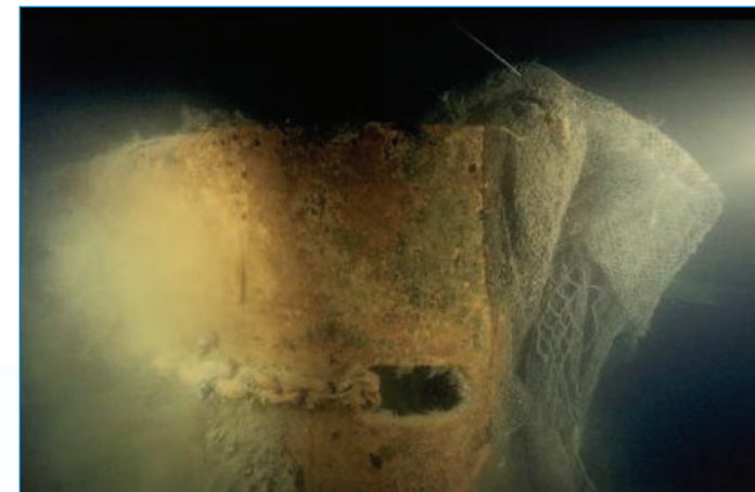
AE2's bow draped in fishing nets

In February 2007, a Mission Rehearsal training exercise was conducted in the deep waters off the Victorian coast. The 13 divers and 2 film crew had the chance to dive with technical equipment on a scuttled J class submarine in deep water, as well as to discuss details of the mission with the scientists, marine archaeologists and engineers who will be making recommendations as to whether the AE2 is intact enough to attempt to raise her to the surface or if she should be left in her silent resting place.